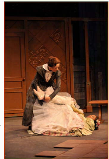
...or things like this happen.