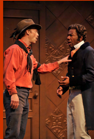
Hortensio, another of Bianca's admirers, enlists the help of Petruchio to marry Kate, as he is "hoping to wive it wealthy". Hortensio poses as Bianca's music tutor.

"When I am alone, why, then I am Tranio, but in all places else your master Lucentio." - Tranio, ACT I SC 1