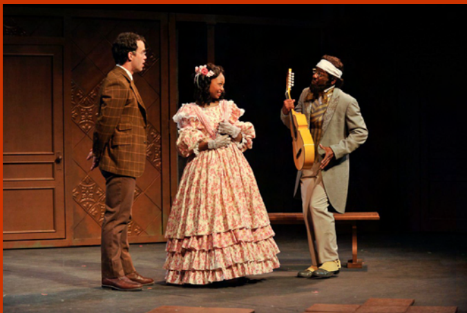
With Kate promised to wed, Bianca's front-running suitors make their move

Petruchio: "I swear I'll cuff you if you strike again. Kate: "So may you lose your arms. If you strike me, you are no gentleman. And if no gentleman, why then no arms." - Duke Frederick, ACT II SC 1