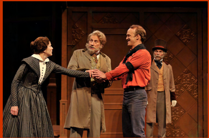
Baptista readily accepts Petruchio's proposal to Kate, and promises that they will wed. She is less than pleased.

"You have show'd a tender fatherly regard To wish me wed to one half lunatic, A madcap ruffian and a swearing Jack." -Katherine, ACT II SC 1