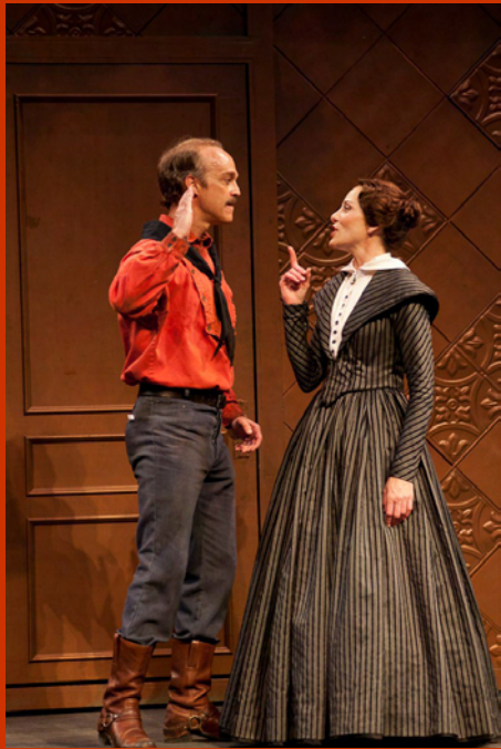
Kate and Petruchio's first meeting is not exactly love at first sight.