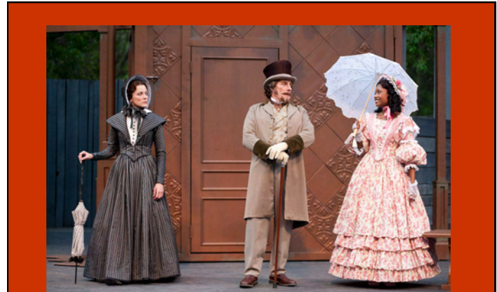
When the Minola family arrives (along with some of Bianca's suitors) Lucentio becomes immediately smitten with the striking Bianca, and learns that she is not allowed to marry until her shrewish sister Kate weds.

"I firmly am resolv'd you know; that is, not bestow my youngest daughter before I have a husband for the elder." - Baptista, ACT I, SC 1