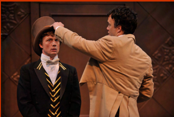
Lucentio hatches a plan to pose as Bianca's tutor in order to win her hand. Tranio in turn poses as Lucentio in order to get him into the position.

"Since for the great desire I had to see fair Padua, nursery of arts, I am arriv'd for fruitful Lombardy." Lucentio, ACT I, SC 1