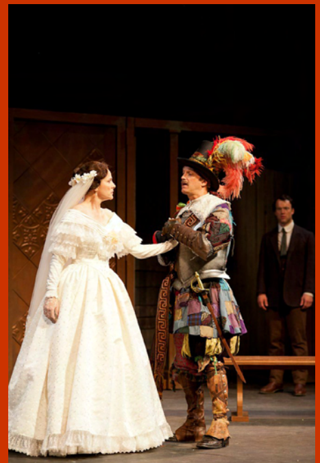
While Kate shows up on time for the wedding, Petruchio rides in late on an old nag, and dressed as a clown.

"Why, gentlemen, you do me double wrong, To strive for that which resteth in my choice." Bianca, Act III Scene 1