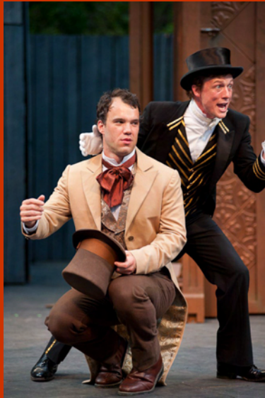
Lucentio and his servant, Tranio, arrive in Padua looking for excitement while Lucentio's father is away.