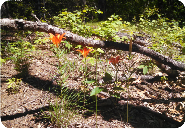
Wild lilies can be found scattered around APT.

In 1830, prairies covered two million acres of Wisconsin. Today, only 2,000 scattered acres survive. Since the late 1980s, APT has increased the amount of native prairie square acreage due to our restoration efforts. With seed collection, plantings, control of invasive species and controlled burns, we have been able to bring back some of the diversity and beauty of the flora and fauna that once flourished here.