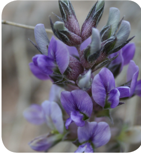
PRAIRIE TURNIP (SPECIAL CONCERN)