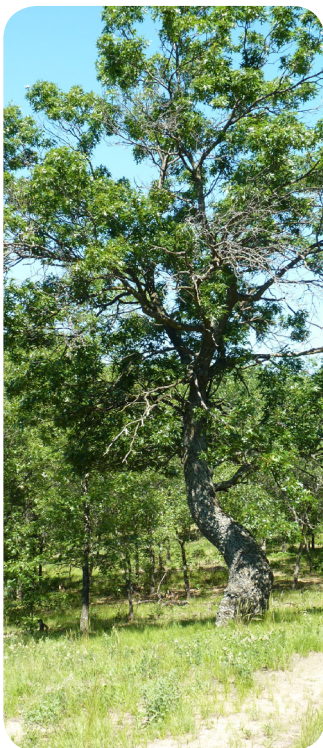
APT's oak savanna located up the hill.