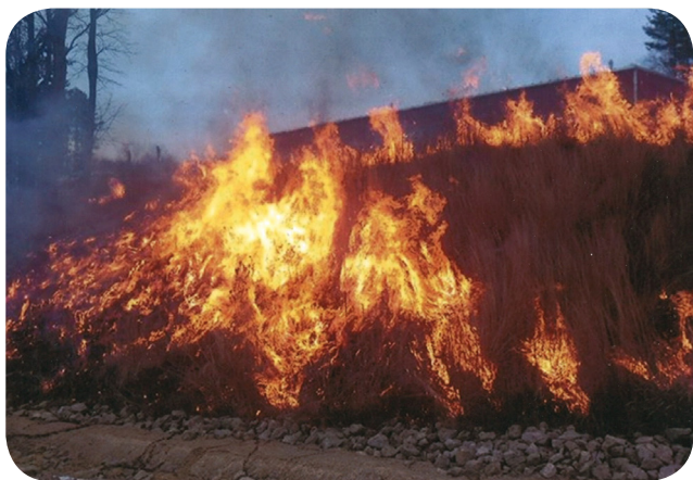
Prairie burnings at APT.

Fire is one of the major management tools we use at American Players Theatre to ensure the health of our prairies and oak savanna. Most prairie species are perennials. The tops die off in the winter, but the root stock survives and re-sprouts in the spring. Fire renews a prairie. It burns the dried dead tops of the plants without damaging the roots. Burned prairies warm up faster and absorb rain more quickly, which allows new shoots to grow sooner. Nutrients from the ash including potash, phosphorus and calcium leach into the soil as the rain falls on it. Fire is essential for native prairie clover and lead plant. These two forbs help to fix the nitrogen in the soil.