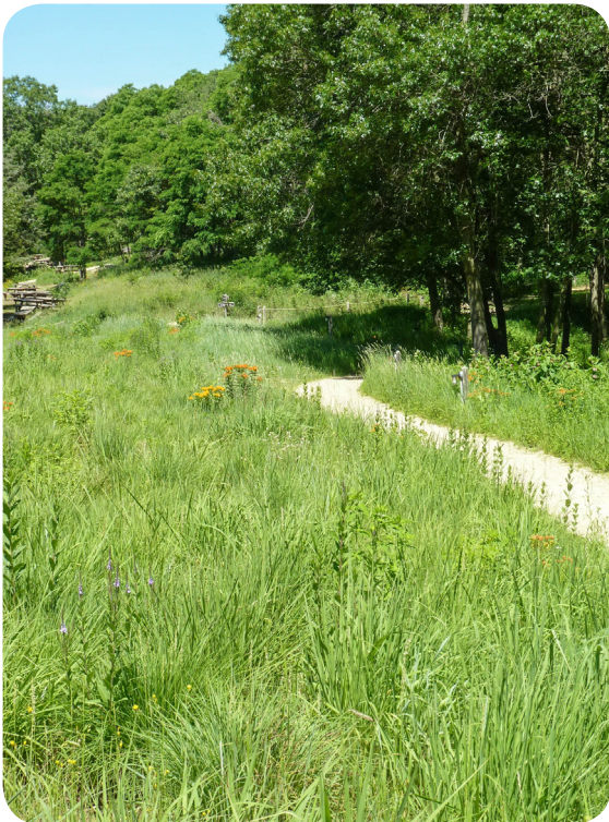
Prairie path located outside APT's Touchstone Theatre.

As stewards of the land we take great pride in the restoration efforts we make to accommodate the many rare and diverse species that live here. APT invites you to experience its unique beauty, and to learn about the rich natural heritage of this land on which we are privileged to make our home and share these amazing stories.