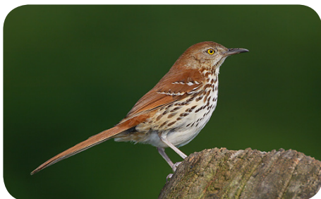
BROWN THRASHER (WATCH LIST)

Images in the Special Plants and Prairie Residents sections are stock photos.