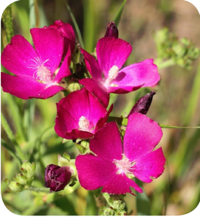
CLUSTERED POPPY MALLOW (SPECIAL CONCERN)