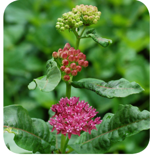
PURPLE MILK WEED (ENDANGERED)