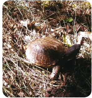
ORNATE BOX TURTLE (ENDANGERED)