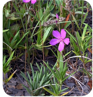
FAME FLOWER (SPECIAL CONCERN)