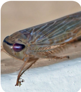
NET VEINED LEAFHOPPER (THREATENED)