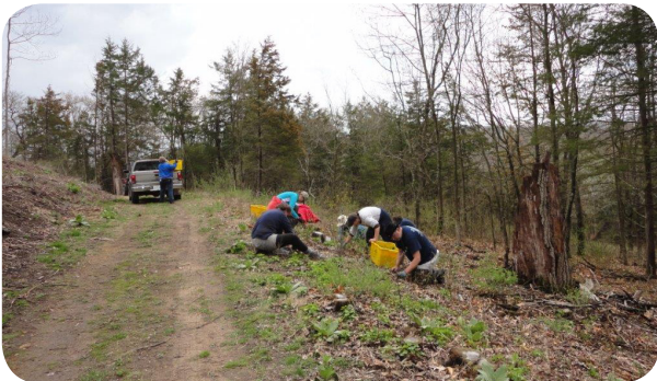
Volunteers working to improve APT grounds.

A Gentle Reminder: Deer ticks and Lyme disease are not new to most of us. Be sure to check yourself and your trail buddies thoroughly for these tiny annoyances so they don't become larger problems. Acquaint yourself with signs and symptoms of tick-borne illnesses as they can be serious. To avoid these threats as well as poison ivy and the spreading of garlic mustard seed, please stay on the marked trails.