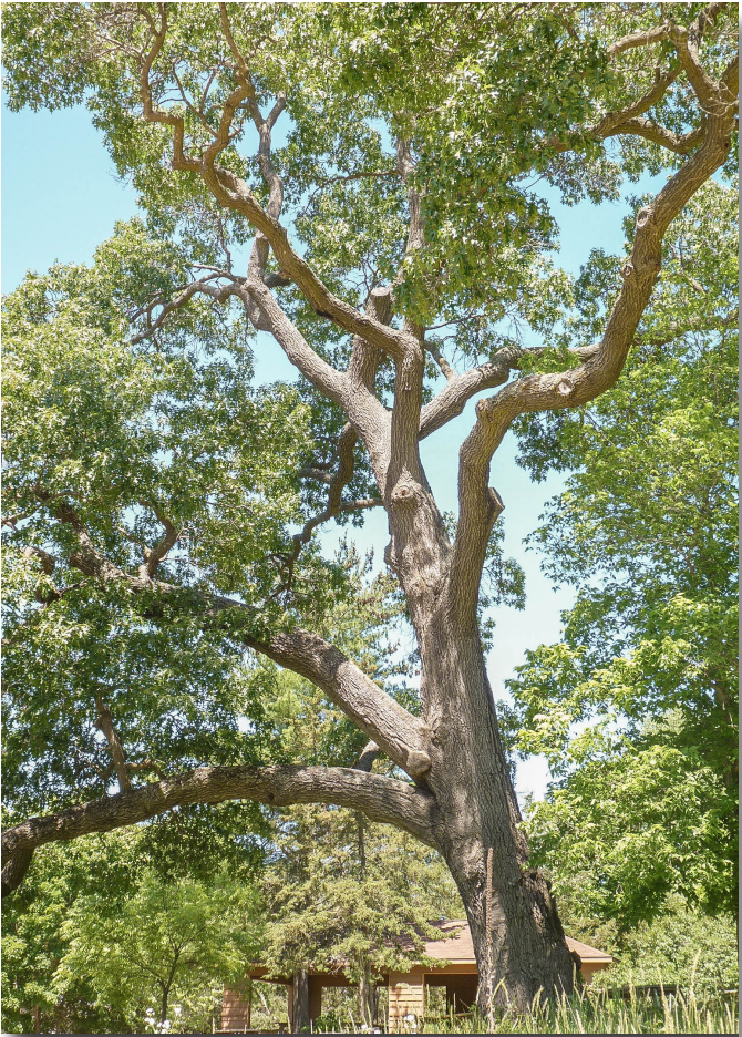
APT's Champion Oak Tree.

Learn about APT's landscape and ecological mission.