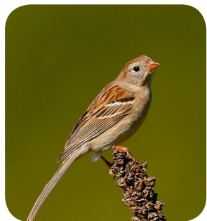
FIELD SPARROW (WATCH LIST)