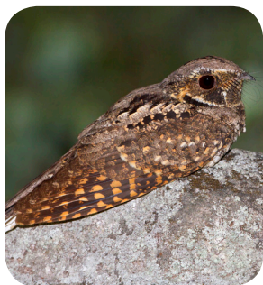
WHIPPOORWILL (WATCH LIST)