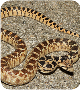
GOPHER SNAKE (SPECIAL CONCERN)