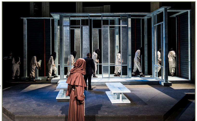
The set acts as both the city and the prison.

"This wasn't us putting something on the play, but rather allowing the artists on the stage to bring their whole selves to the narrative," she continues. "Not ignoring that we are actors of color telling these stories. It made the cast talk about these things in a real way. When politics and political views begin to play a key role in the rehearsal room, we have the opportunity to have a more thorough conversation that includes more voices. The text remains the same, but the way in which each word is seen changes depending on how we walk through the world. This is important. It is the reason I do theater. The way other people have read the text in the past is