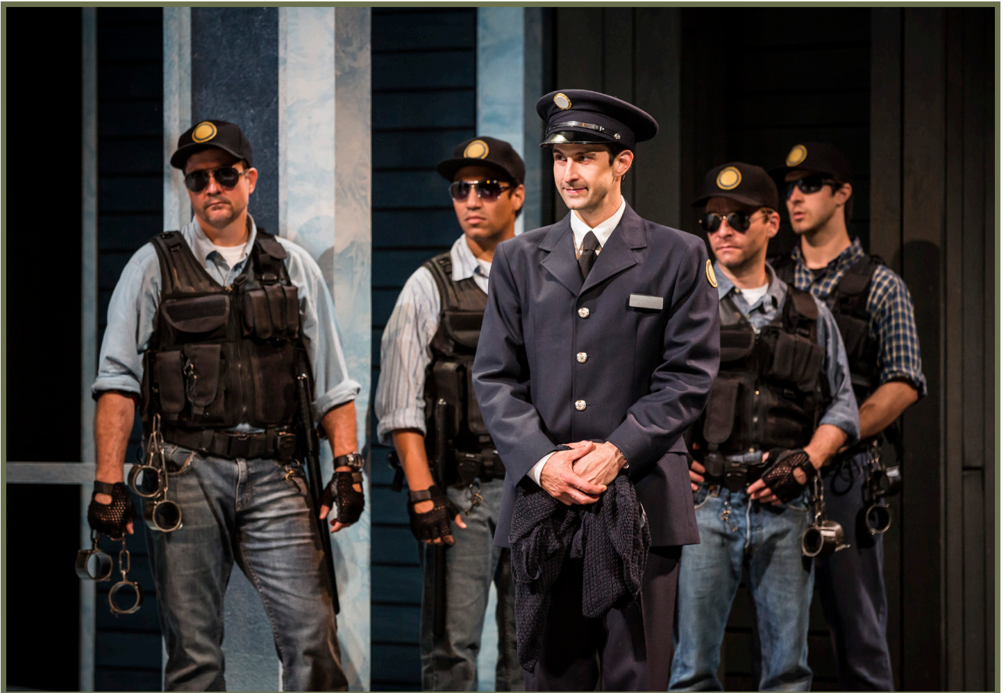
Officers under Angelo's command.